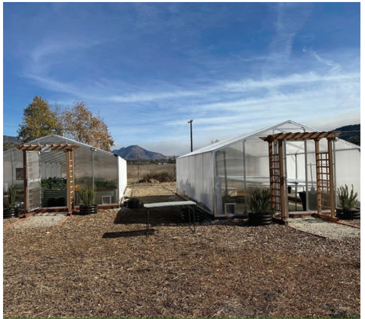
New Green Houses - Sustainable Agriculture classroom and supplier to school kitchen