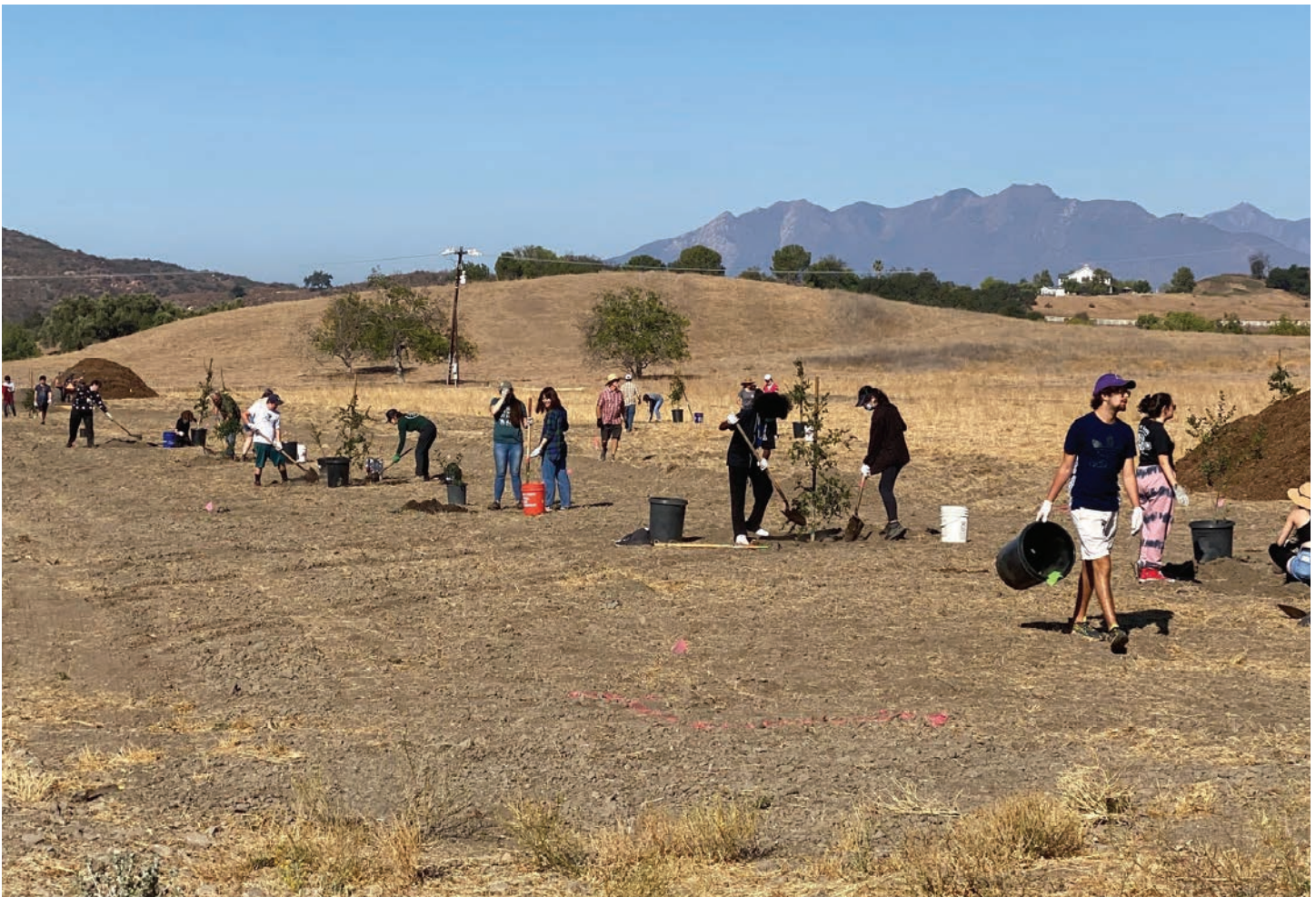
Thomas Fire Restoration Planting