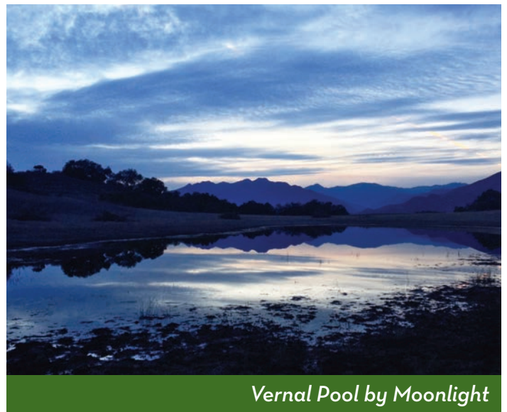
Vernal Pool by Moonlight