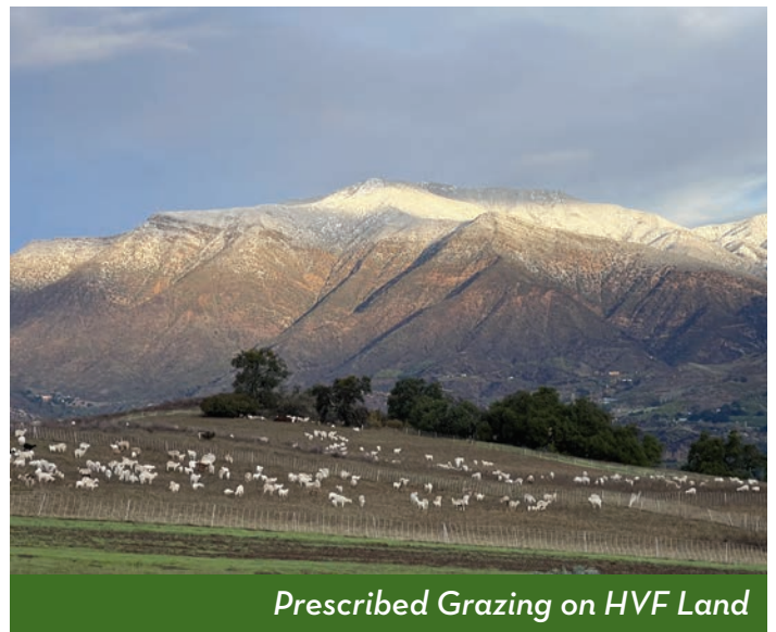
Prescribed Grazing on HVF Land