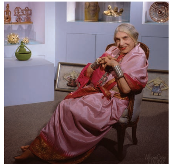
Beatrice Wood, 1987