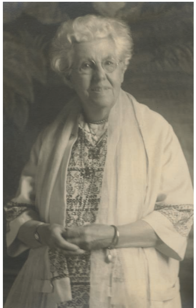
Annie Besant, D.L. Ojai, CA 11th January, 1927

“ One of the beauty spots of the world is the Ojai Valley in California. Mountains ring it round; it has remained secluded till recent times, and is still but sparsely inhabited. In winter snow lies on the high mountain-tops, but does not reach the Valley. The climate is superb; orange-trees laden with golden fruit grows [sic] in parts of it, apricots and other fruit trees in other parts. The sun shines out from a sky of deepest blue, and as it sets behind the mountain peaks, it paints the mountain sides in various purples and violets, and when clouds float in the clear air, and stream across the blue, it paints them in deepest crimson and glowing orange, and through the gaps we see lakes and rivulets of greenish blue, a panorama of gorgeous splendor that I have only seen rivalled in Egypt or, in the rainy season, in India. ”